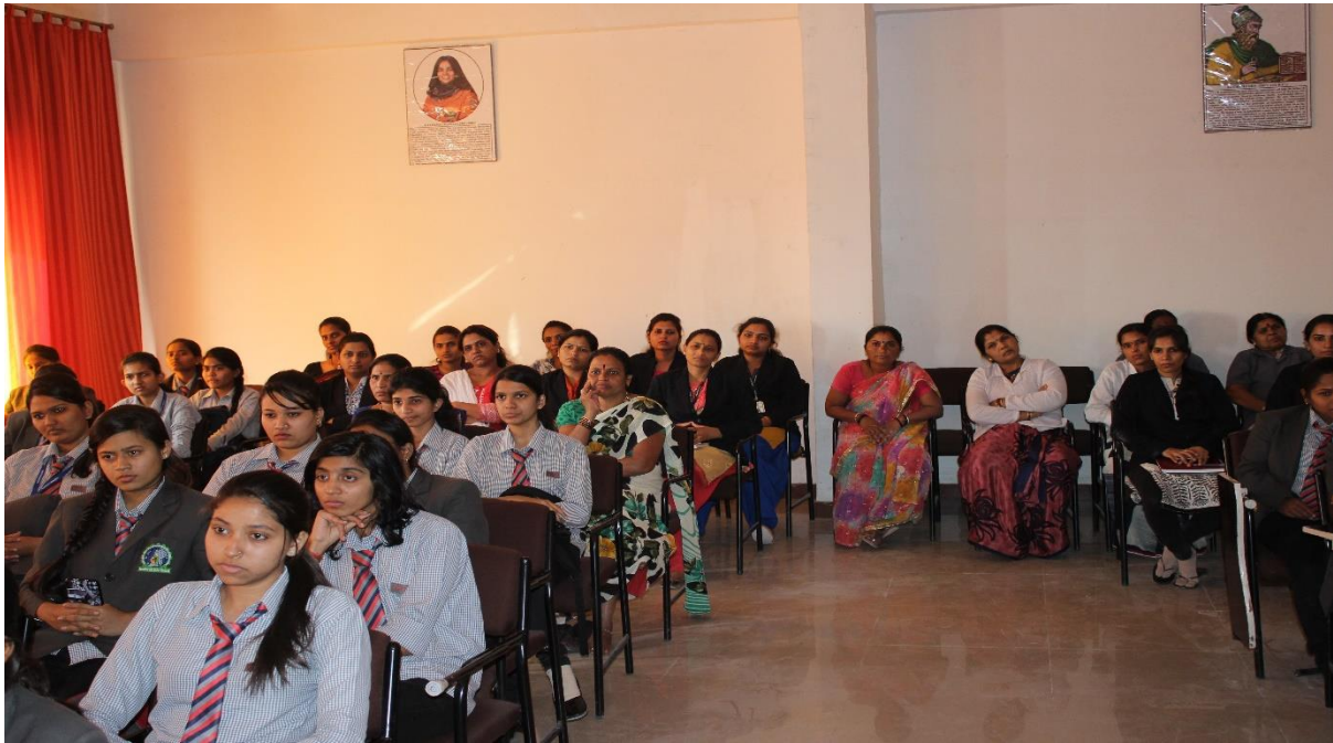
Ladies staff members (Teaching and Non-teaching) and students attending the session